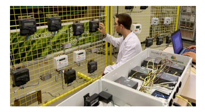
Smart metering communication platform at TECNALIA